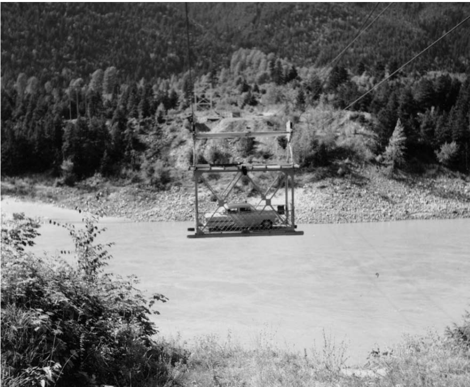
The North Bend/Boston Bar Aerial Ferry

as a part of the Highway system and the tolls were taken off. On special holidays such as May Day in North Bend or July 1st in Boston Bar, a group of 20 people attending dances could pay in advance $1.00 for an extra run at 2:30 am, and additional passengers paid 5 cents. If you missed the run you were stranded until the next day.