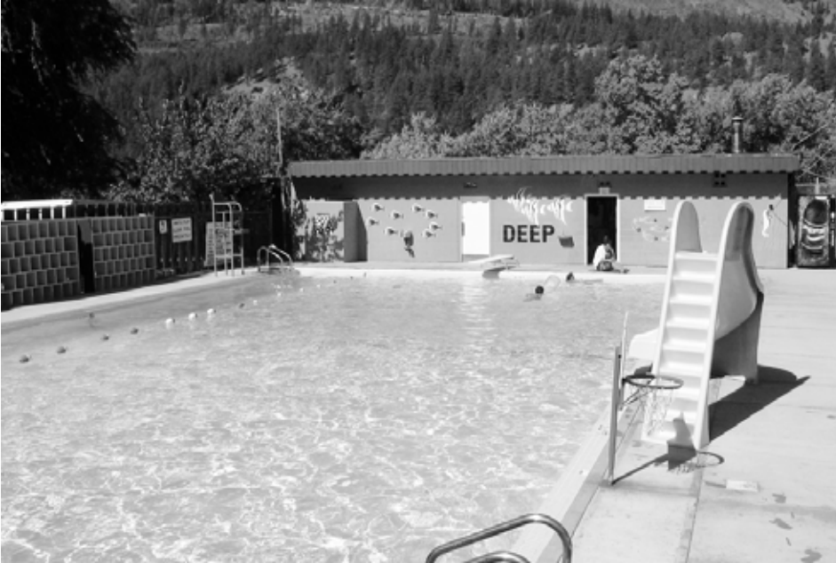
The Bert Erickson - Expo 86 Legacy Fund - Village of Lytton Swimming Pool.

Judging from the screams of joy and the noisy splashing next door, the swimming pool has to be the most popular spot in town on these hot days.