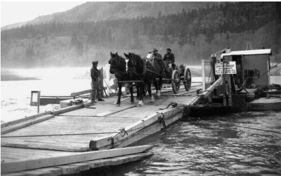
The Lytton Ferry