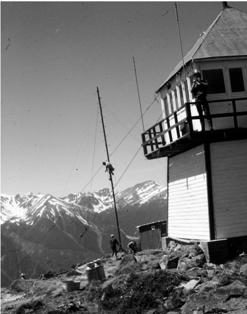
Rigging the new forty foot tower during the brief summer work opening.