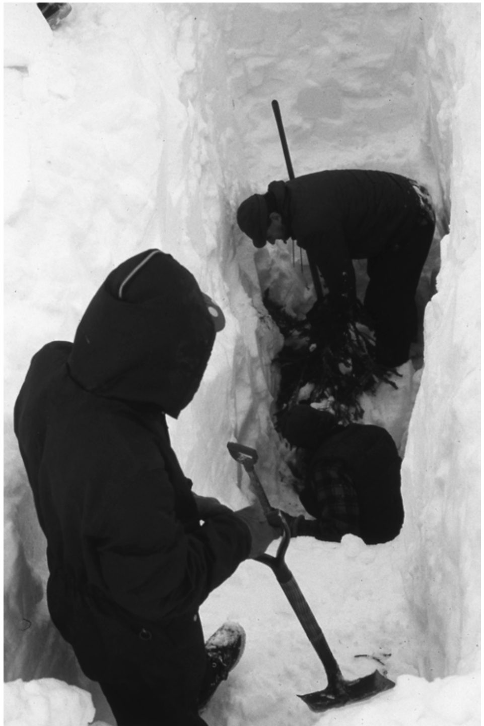
Digging a snow trench at the upper site to find a break in the power cable.

It will be interesting to see what happens in the future. The Lytton & District TV Association 'name' is no longer – it is now the Lytton Area Wireless Society. It claims to have three sub-groups: Internet, TV and radio. High Speed Internet is the buzz-word now. The local television volunteers are very hard workers, sadly in short supply. The equipment they need to keep going is very expensive, Page 4