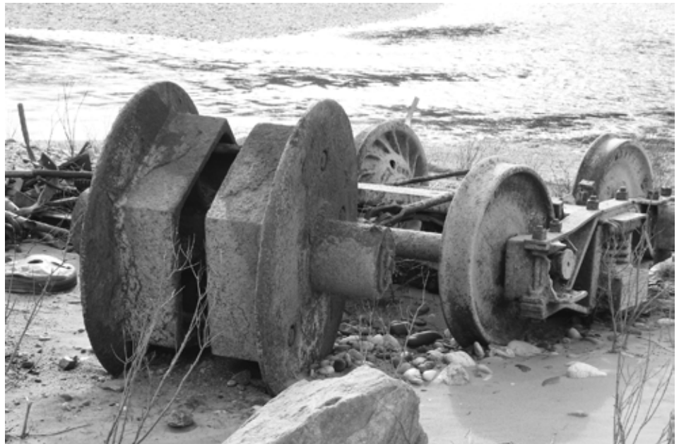
The mystery object sitting well above the water, waiting to be moved to a temporary storage area in preparation for display at the Museum.