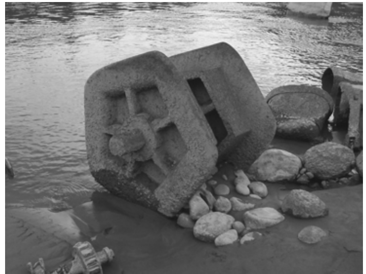
The dredge parts near Kanaka from Newsletter Volume 6 Issue 2. Compare this to the artifact from the Thompson (below).