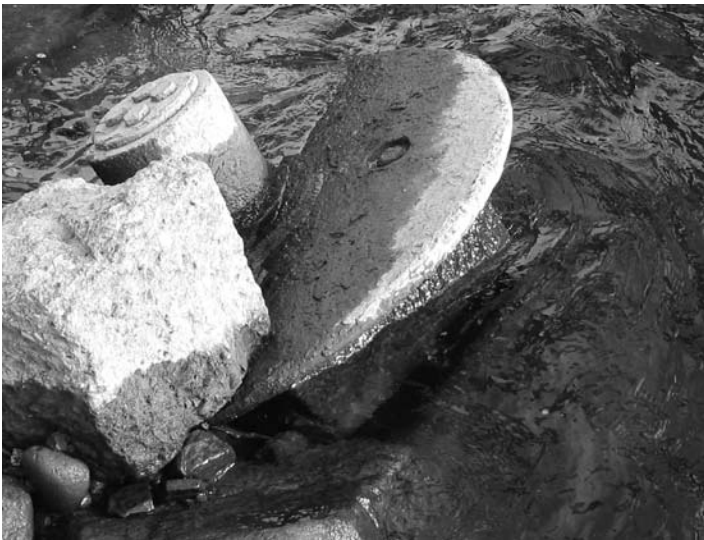
The mystery object from Newsletter Volume 7 Issue 2. Now that it has been removed from the river (see below) we can be fairly certain what it is.