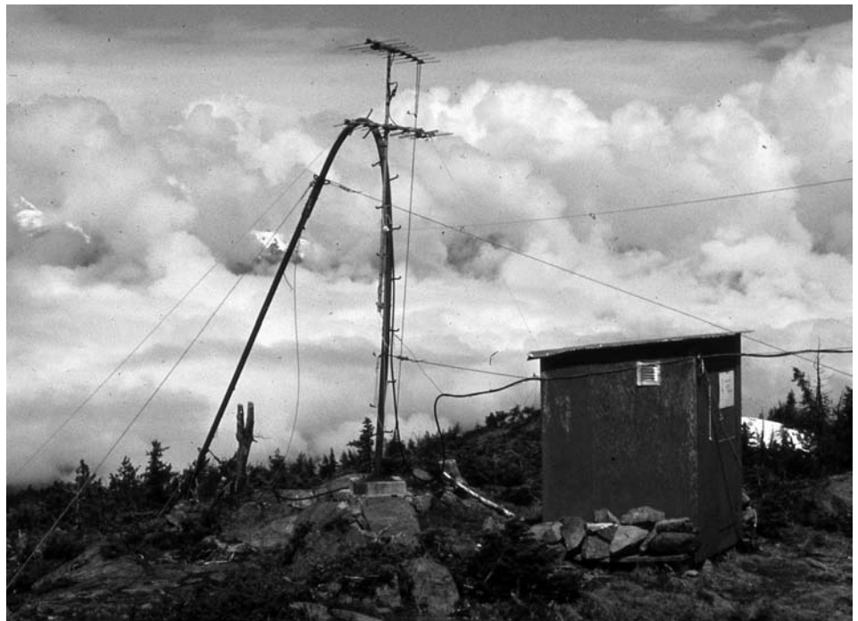
The forty foot mast (previous page) bent in two after a harsh winter season.

receives approximately $8225 per year, while any given piece of equipment can be approximately $17,000 per channel. Thus it has been necessary to replace