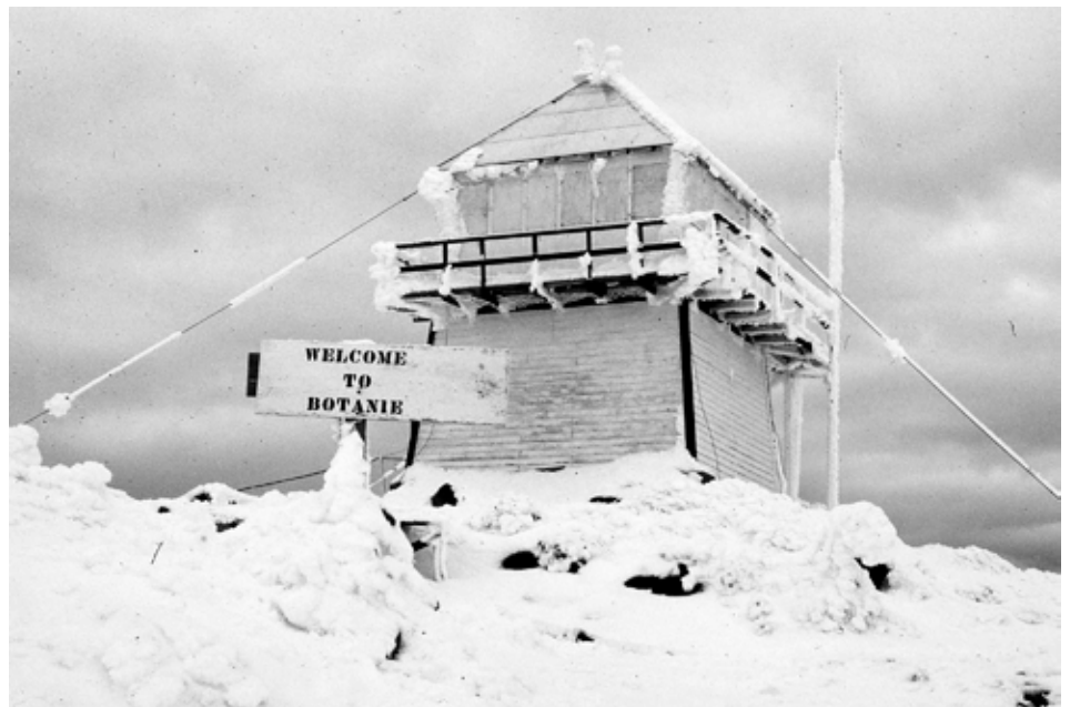
The upper site at the peak of Botanie Mountain. Weather is a factor!